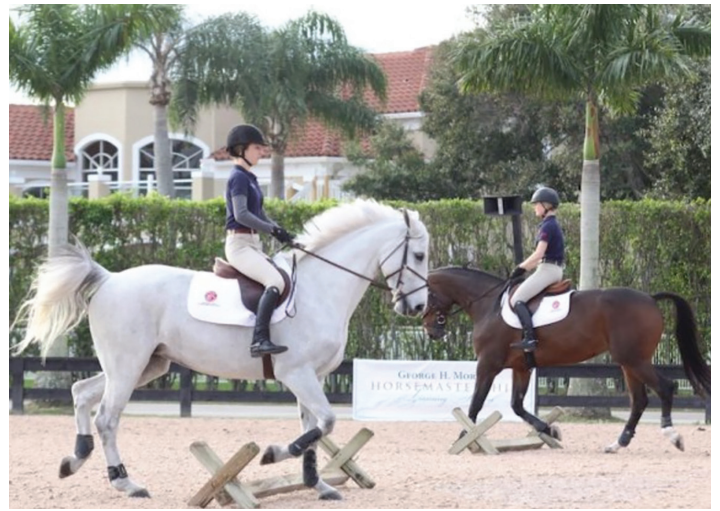
Trotting or cantering cavaletti allows the horse and rider to establish a consistent rhythm.

In leg yield and shoulder-in, we are working on using lateral aids on the horse. Lateral aids is to say aids on the same side, left rein and left leg for example. In leg yield, the rider pushes the horse with left rein and leg to the right so that the horse moves forward and laterally at the same time. The horse will naturally cross the inside front leg in front of the outside front leg. The same exercise can be done with the right rein and right leg pushing the horse to the left.