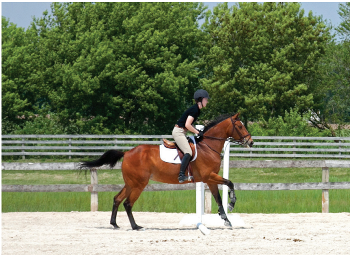
Developing the horse's rhythm in all gaits is the first building block in the training pyramid.

Relaxation: This is the second building block of the triangle. It may be the most important, but one that is skipped the most frequently. A relaxed horse is one that will be a willing partner in what you ask of him, whether that be going forward, collecting, or moving laterally. Elasticity and suppleness are the keys here. The horse needs to be able to demonstrate his adjustability by lengthening and collecting his stride. This is known as longitudinal suppleness.